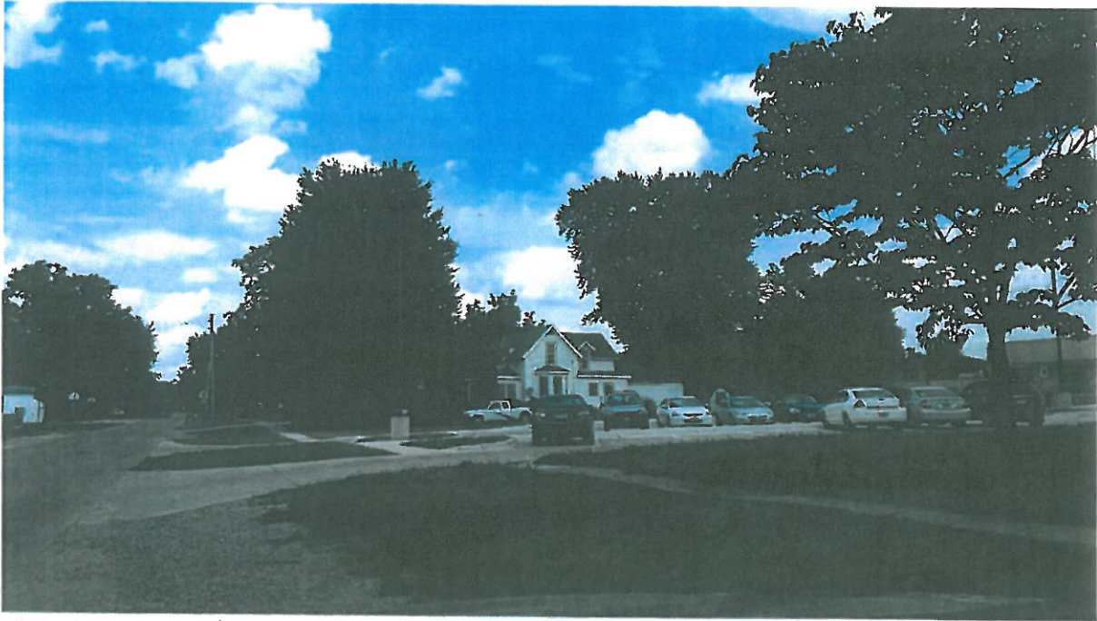
View along North 2 nd Avenue