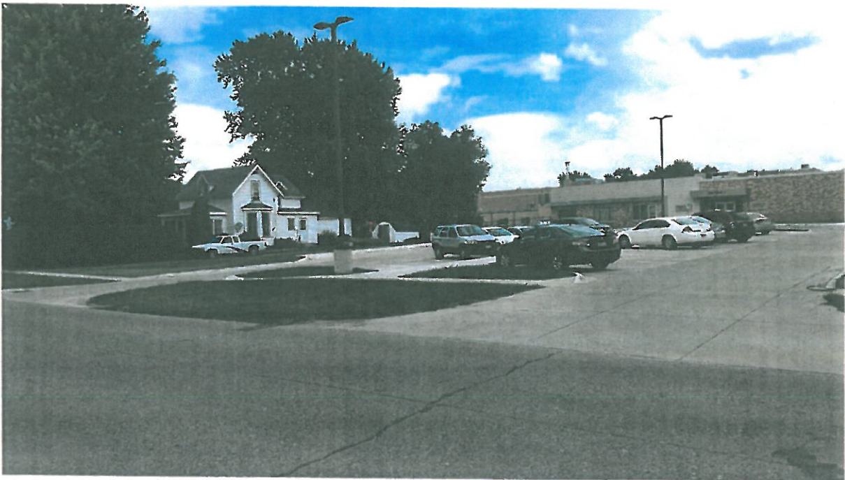
View of Early Childhood Center/Drives