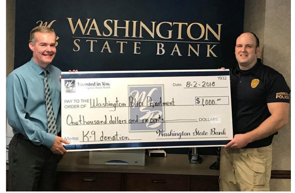
K-9 Donation from Washington State Bank

Washington’s department includes 11 sworn full-time officers (including Chief and 2 Lieutenants), 4 sworn part-time officers, 1 full-time administrative assistant, and 1 part-time administrative assistant. The department fulfills functions including SWAT, K-9, investigations, drug task force, and many more. The department was recently authorized to purchase a new K-9 unit, which is expected to go in service this spring with a new handler as the current K-9 retires. The department’s annual budget is approximately $1.3 million.