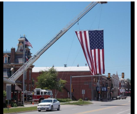
Fire Dept 9/11 Observance