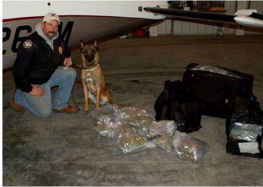
Major Drug Bust with K-9 Ultro

Department equipment includes: 3 patrol SUVs, 3 administrative SUVs, 1 K-9 SUV, 1 CRU (Critical Response Unit), and 1 MRAP (Mine-Resistant Ambush Protected armored personnel carrier). The department expects to be able to replace 2 patrol units in 2019 and the third in 2020, and be on an approximate 3-year cycle for replacement of all patrol units from that point forward. Other priorities include complete replacement of the department’s tasers within the next two budget years.