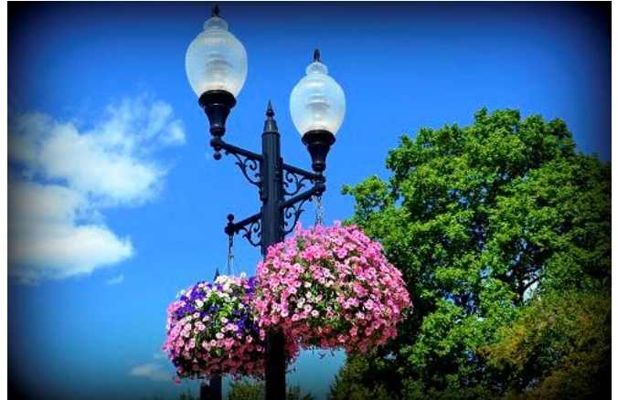
Downtown Streetlights & Flowers

Washington is a growing county-seat community of 7,266 residents located 30 miles southwest of Iowa City and just 8 miles west of 4-lane U.S. Highway 218 in Eastern Iowa. Washington County has a population of nearly 23,000 residents. The area enjoys a diversified and growing economy based around agriculture, ag business, light manufacturing, education, healthcare, hospitality, and construction, among other sectors. Washington County is home to the Riverside Casino and Resort, one of Iowa's premier gaming destinations. It also happens that due to close proximity to the Iowa City area that the University of Iowa and University Hospitals & Clinics are among the top employers of Washington County residents. Washington is a Main Street community, and has enjoyed over $10 million in private investment and an additional $10 million in public investment in its classic downtown square area in the past 10 years.