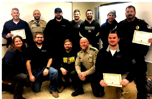
No-Shave November with WCSO & Communications

All officers in the department have at least five years’ professional experience in law enforcement, but six of these officers are age 31 or under. It is considered very important that the new Chief work to develop leadership and training opportunities within the department to ensure continued success and long-term sustainability.