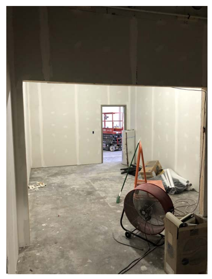
Page 3 of 6