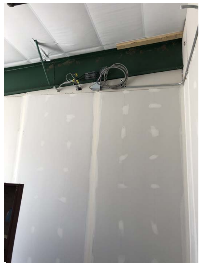
Page 1 of 6