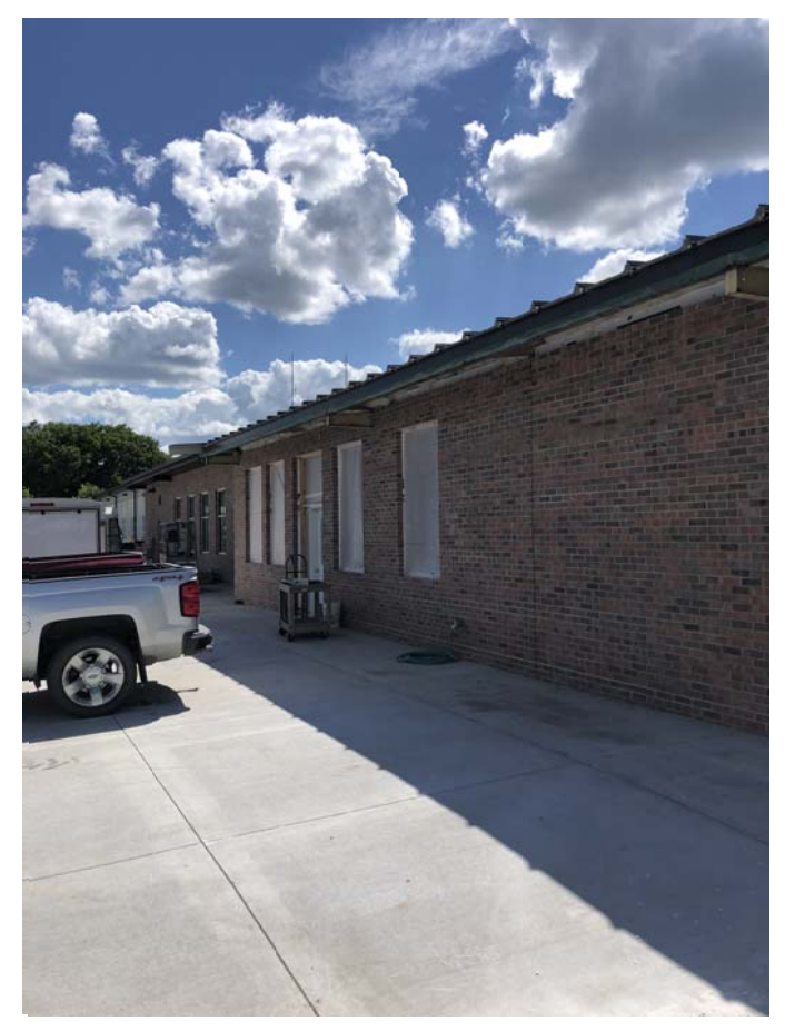
Page 4 of 6