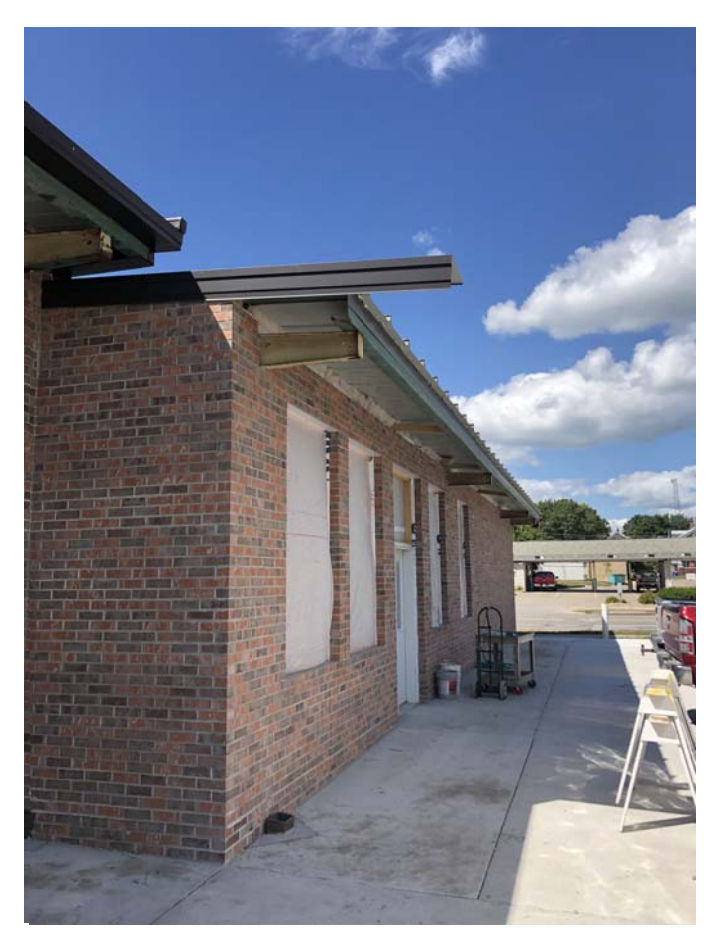
Page 5 of 6