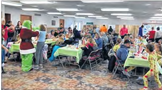
Breakfast with Grinch, Santa and Mrs. Claus was held in Richland Saturday.

Your official newspaper for Jefferson County: Richland, Packwood, Olie, Pleasant Plain, Hedrick and the Pekin Community Schools Vol. 142 No. 49 • $1.00 • Thursday, December 08, 2022