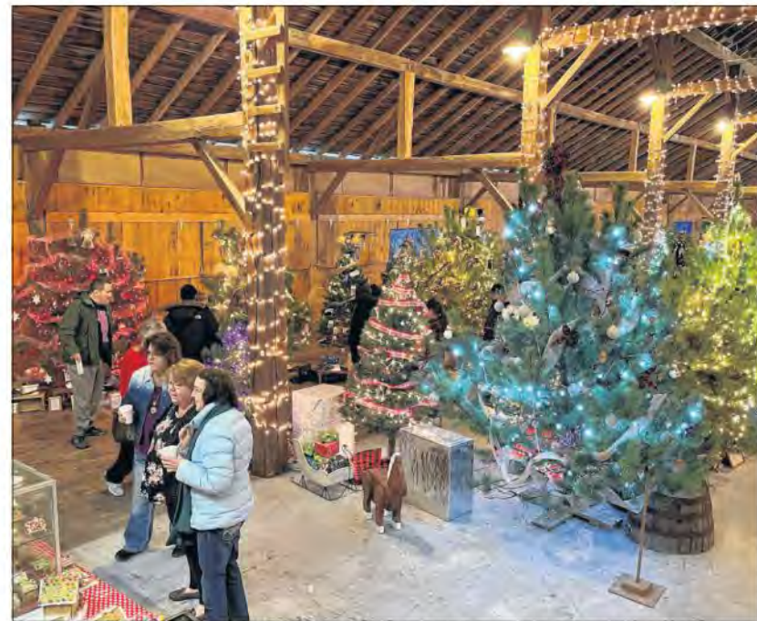
Visitors enjoy the Tannenbaum Forest at the Festhalle, Amana, during Prelude to Christmas in Amana, Dec. 2-4. Over 70 live evergreen trees were decorated by area businesses and community groups. The forest remains open through Dec. 18.